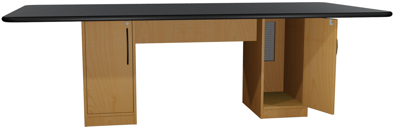
AVCONF48096 (rectangular top) with cpu/storage bases and perforated inserts