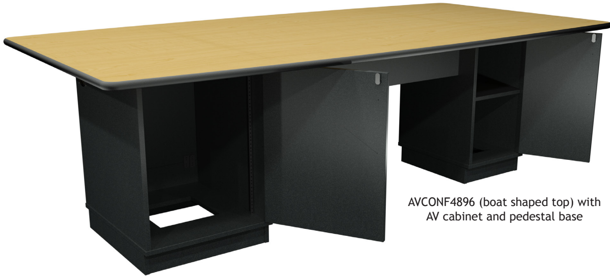
AVCONF4896 (boat shaped top) with AV cabinet and pedestal base